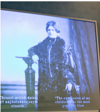
Film narrated by Pauline Wengeroff

Exit from the Synagogue, turn left and follow the corridor to the area with the large royal portraits. From there, enter the yellow room. The film is on your left and the silhouette on your right.