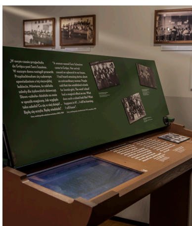
Religious school desk

From the Street, enter the third doorway on the right to the Politics area. Across the Street, in the Culture area, is a wall of newspapers – in the Polish section you will find Ewa .