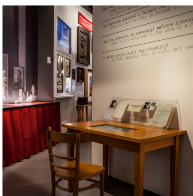
Sara Hurwic’s desk